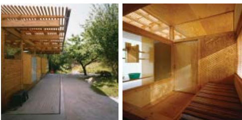
Annex at Finnøya summer house, Lindesnes 2004