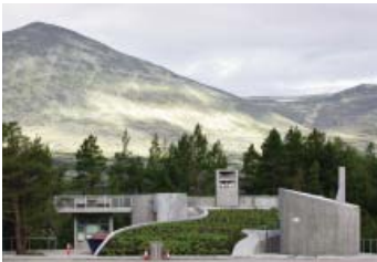
Strømbu Service centre and rest area, Rondane Tourist Road. 2008