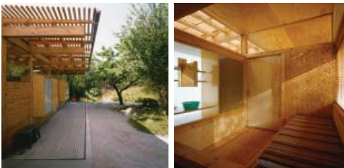
Annex at Finnøya summer house, Lindesnes 2004