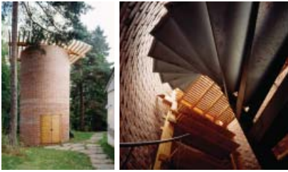
Garden Shed and workshop, Oslo. 1995