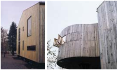
House Stensrud/Myrtveit rebuilding and addition to private house, Oslo. 2005