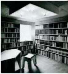
Private library, Oslo. 1990-91