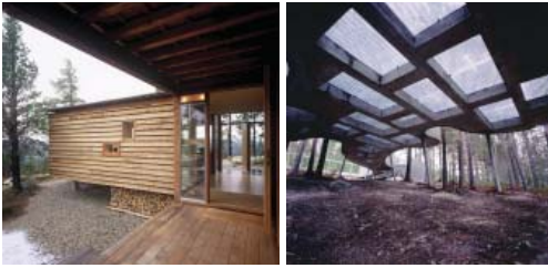
Sohlbergplassen viewpoint, Rondane Tourist Road. 2005