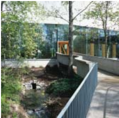
Visitors centre at Bjerkebæk, Lillehammer. 2007