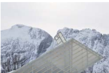
Jektvik Toilett, kiosk and ferry area, Helgelandskysten Tourist Road. 2010