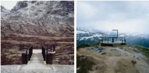
Three viewpoint platforma, sognefjellet mountain road. 1997