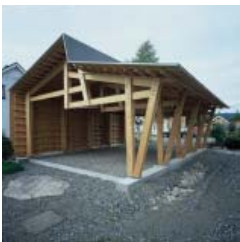
Carport, Dokka. 2003