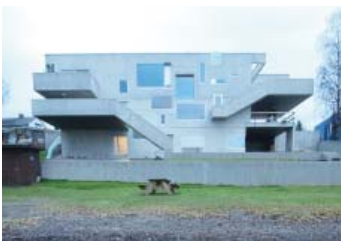
Sandvika, Private House, Lillehammer. 2012