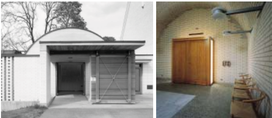
Mortuary at asker Crematorium, Asker. 1999-2000